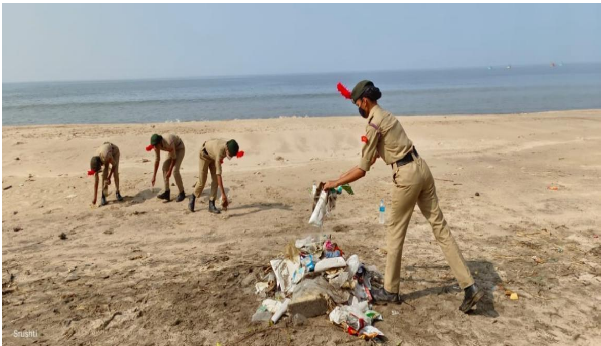
Cadets cleaning the Beach areas. (Puneet Sagar Campaign-2021-22)