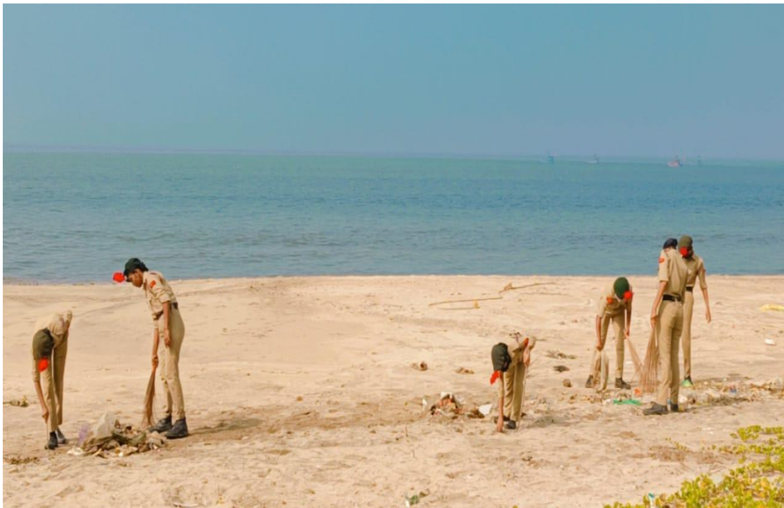
Cadets cleaning the Beach areas. (Puneet Sagar Campaign-2021-22)