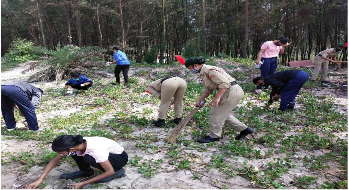
Cadets cleaning the Beach areas. (Puneet Sagar Campaign-2021-22)